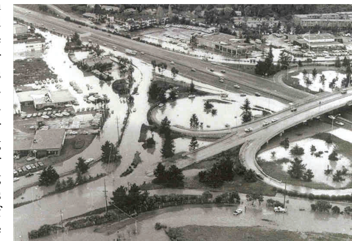
Flooding within Corte Madera in 1982

Flooding within the Town of Corte Madera is caused by three sources: extreme high tides, storm water runoff, and in certain areas substandard storm drainage infrastructure. Floodwaters can spread over many blocks, reaching depths of up to two or three feet, and covering streets and yards. This can lead to flooding of parked vehicles, garage areas, basements, and lower floors of structures.