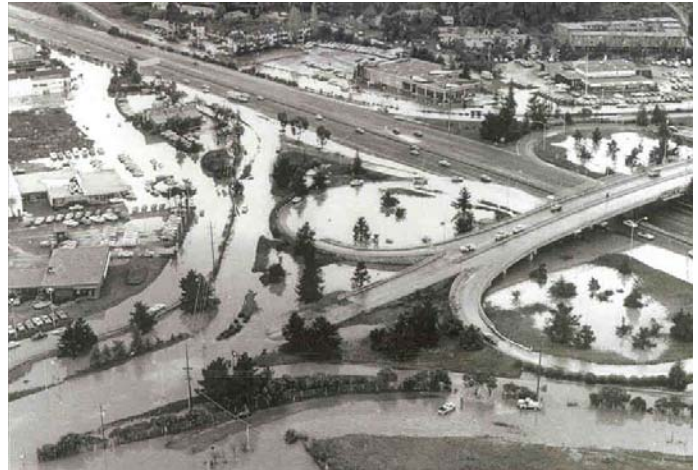
Flooding within Corte Madera in 1982

Flooding within the Town of Corte Madera is caused by three sources: extreme high tides, storm water runoff, and in certain areas substandard storm drainage infrastructure. Floodwaters can spread over many blocks, reaching depths of up to two or three feet, and covering streets and yards. This can lead to flooding of parked vehicles, garage areas, basements, and lower floors of structures.