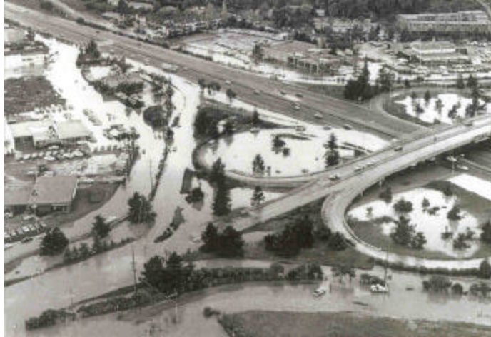
Corte Madera flooding in 1982

Your property may not have flooded recently, however future flooding may occur. If you are in a flood plain, it is probable that someday your property will be damaged. This article gives you some ideas of what you can do to protect yourself.